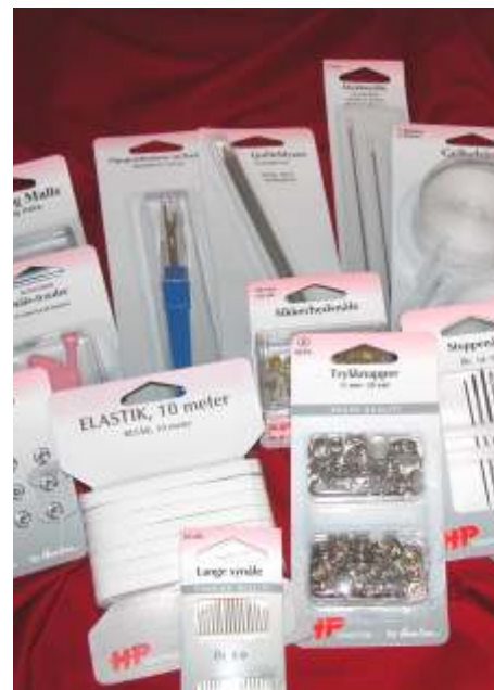
Pictured above are a sample of the range of Hemline products sold in Denmark in their distinctive, subtle pink and grey packaging.

Whether it is the colour or just the quality and competitiveness of the Hemline range, something must be right, as HP has reported that Hemline overtook their previous haberdashery line in the very first month of release and sales have been very strong since and required a new rush order to HTL!