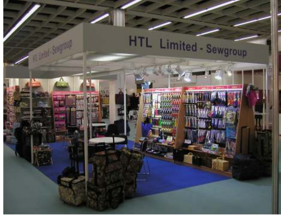
HTL's Display drew plenty of attention at this year's H & H Show

HTL-SEWGROUP once again exhibited at the H & H Show held in Köln Germany from April 4th to April 6th 2004.