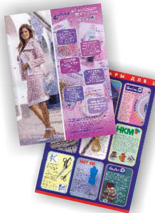
Pictured here are some of the recent magazine advertisements placed by Gela Ltd.