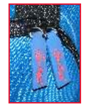
Pictured above is the latest Deluxe Sewing Machine Trolley Bag (N4685), with the Embroidery Arm Accessory bag (N4686). Inset: New, distinctive 'Sew Easy' moulded rubber zipper tags.